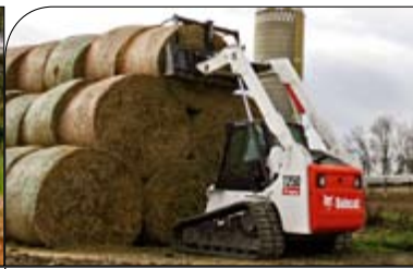
T250 / T250H