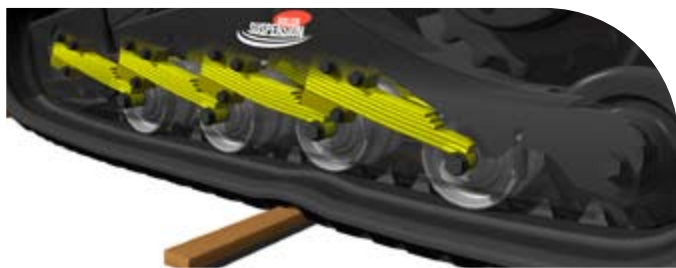
More space in sprocket area

Enjoy a smooth ride thanks to the robust revolutionary Roller Suspension™ system. The all-steel design ensures a comfortable ride in any job site situation.