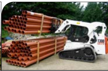
T300 / T300 H