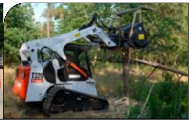
T320 / T320 H