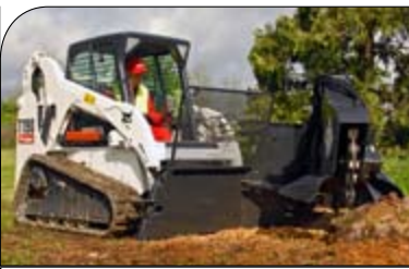
T190 / T190H