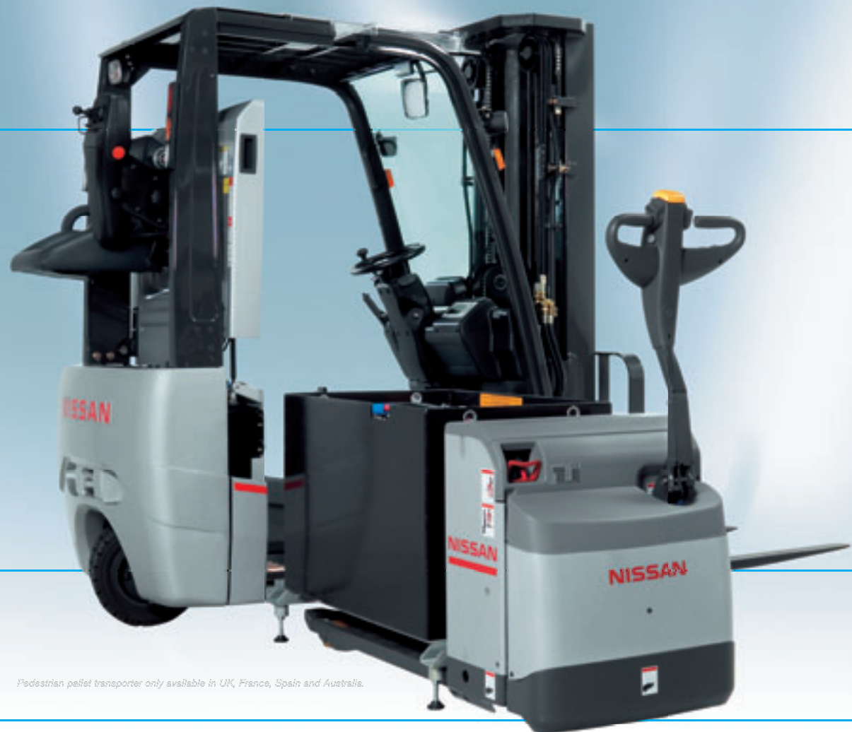
Pedestrian pallet transporter only available in UK, France, Spain and Australia.